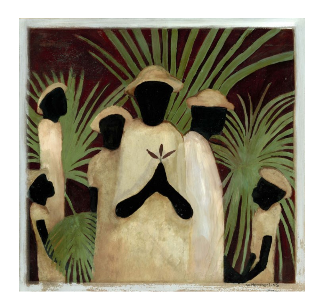
St. Helen's Anglican Church of Canada Diocese of New Westminster