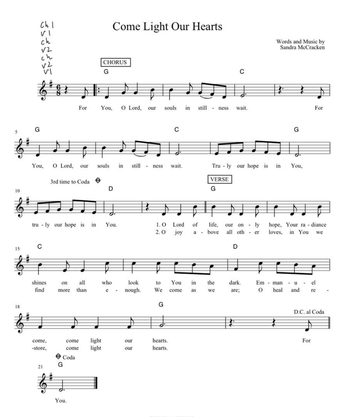
CCLI Song # 7054135 © 2015 Drink Your Tea Music For use solely with the SongSelect®. Terms of Use. All rights reserved, www.ccli.com