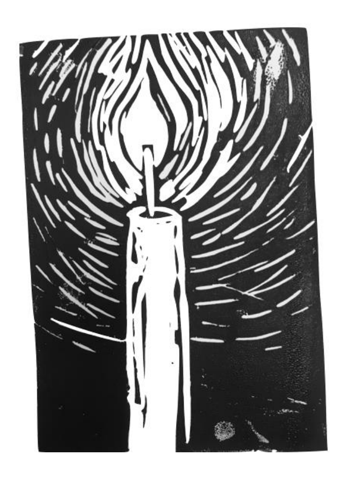
St. Helen's Anglican Church of Canada Diocese of New Westminster