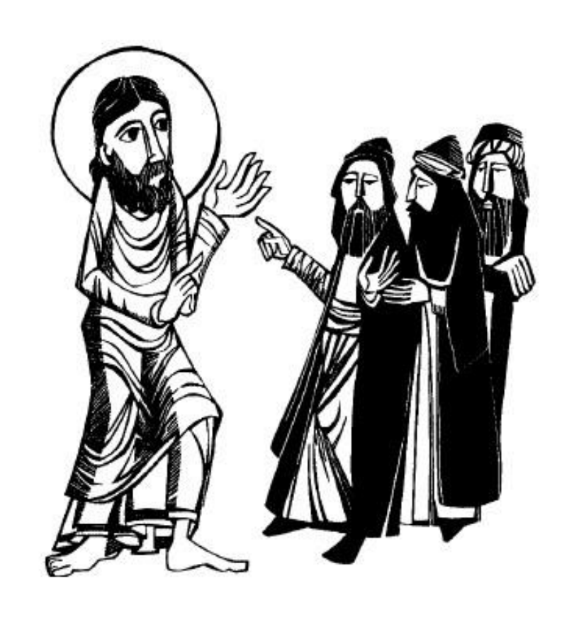
St. Helen's Anglican Church of Canada Diocese of New Westminster